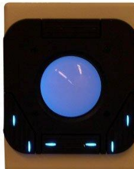
2” DuraTrack Trackball with Blue Backlighting