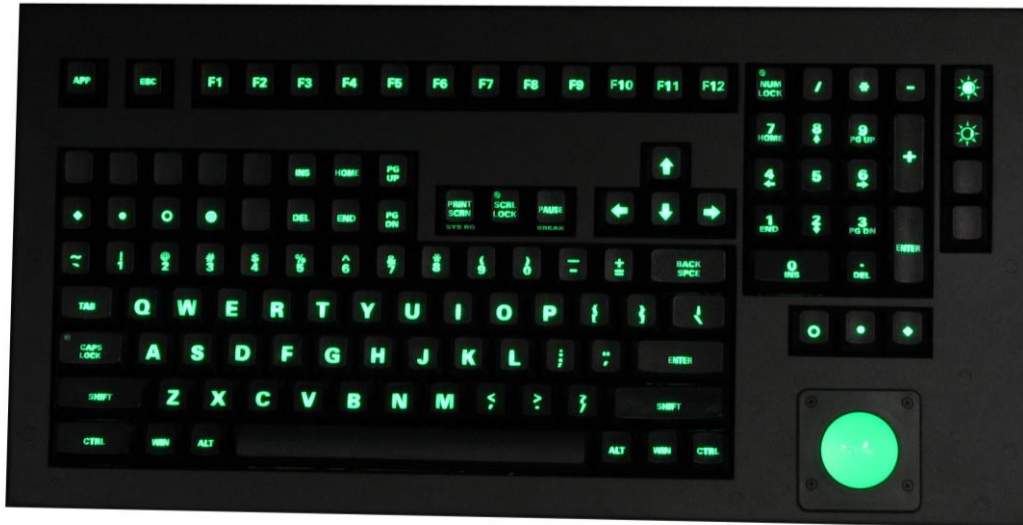
Keyboard and trackball with Green Backlighting

The following are samples of various standard backlighting colors. Pictures are approximate and colors and brightness may vary. Note: Legends used do not change for different colors – so if keys appear different, it is not due to the color used – the products pictured may be from different keysets / designs.